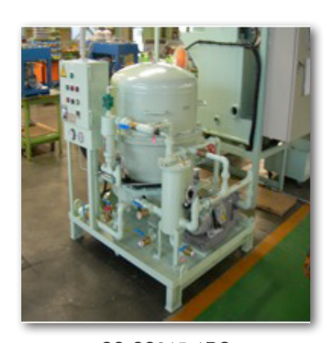
CS-SS315-1RQ at Suzuki Manufacturing