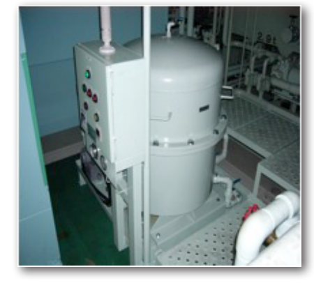
CS-SS315-1RQ at Komatsu Engineering