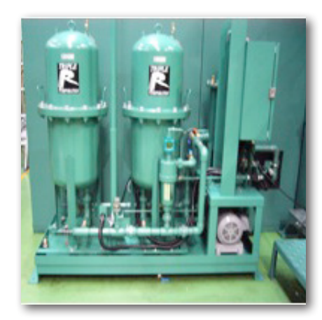
CS-SS306-2RQ at Volvo Korea